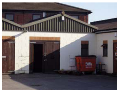
Kennet Enterprise Centre