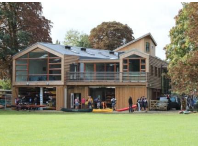
Adventure Dolphin, Pangbourne