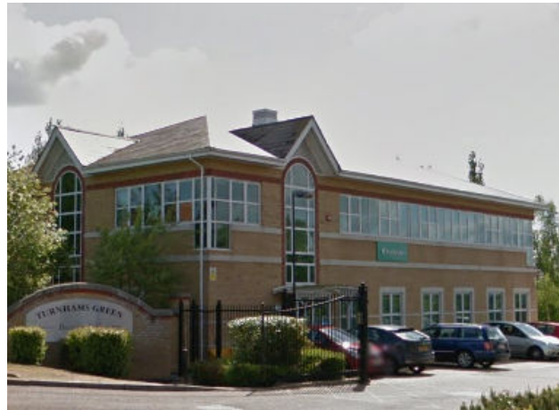
Turnhams Green offices

2.5.1 Operational property is occupied by or on behalf of the Council for the direct delivery of its services, for example Council offices and community schools. Outsourced functions such as sports centres, waste collection and some community care buildings are occupied by organisations providing services on Council's behalf but are still classified as operational property.